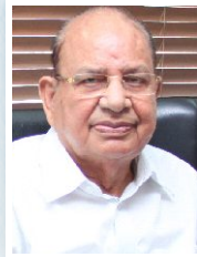
Sh. O. P. Munjal 26 August 1928 - 13 August 2015