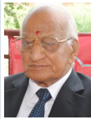
Mahatma Satyanand Munjal 24 May 1917- 14 April 2016