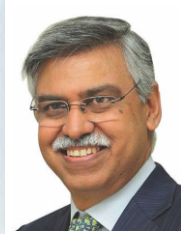
Sh. Sunil Kant Munjal