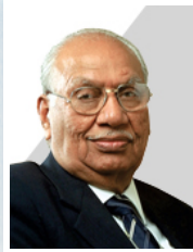
Sh. Brij Mohan Lall Munjal 1 July 1923 - 1 November 2015